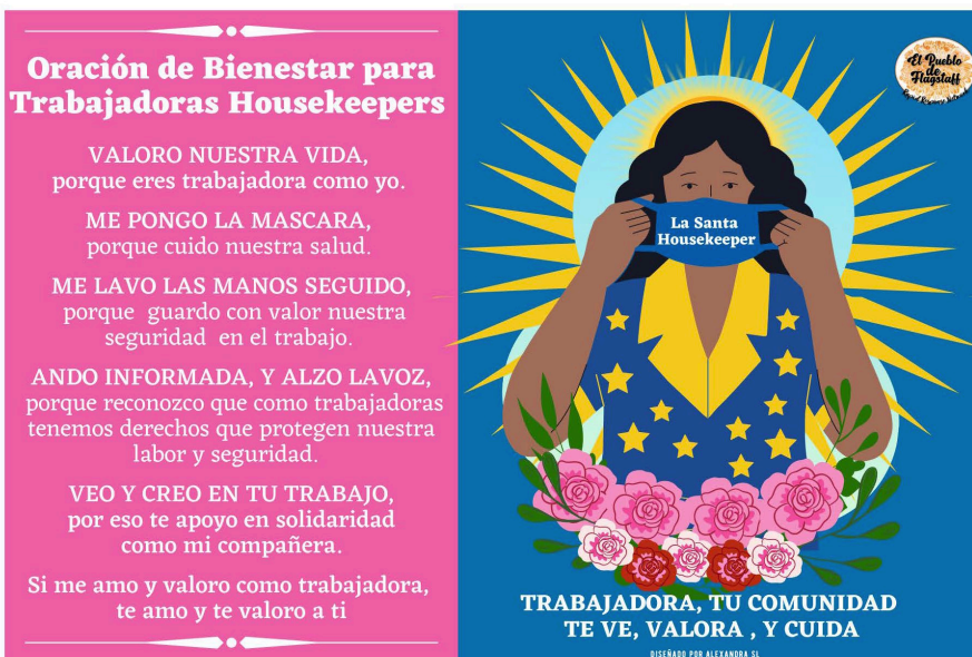
Figure 4: La Santa housekeeper magnates in English and Spanish