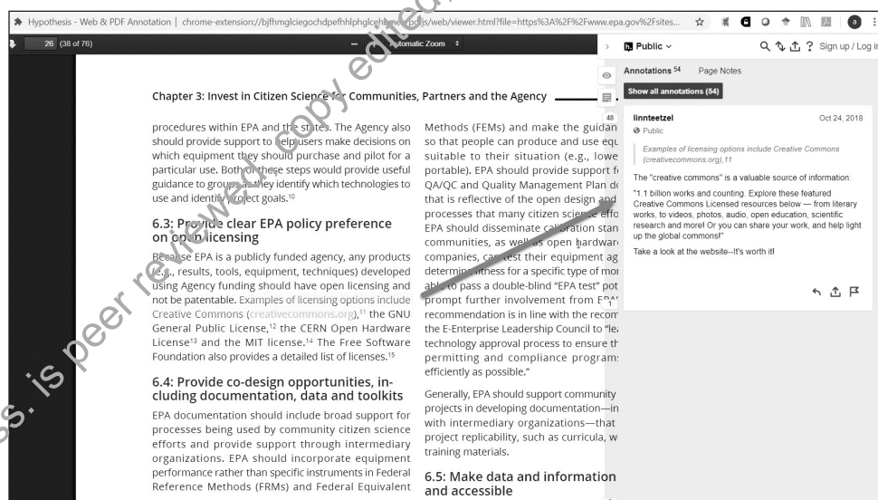
Figure 5. Hypothesis allows users to digitally annotate papers and view annotations by others. Shown here is a public annotation by the Environmental Protection Agency (EPA) on a document by the National Advisory Council for Environmental Policy and Technology, Environmental Protection Belongs to the Public, A Vision for Citizen Science at EPA , EPA 219-R-16-001, 2016, https://www.epa.gov/sites/production/files/2016-12/documents/nacept_cs_report_final_508_0.pdf .

Organizing citations and managing citation styles can be a challenge to new researchers. Because expert researchers often opt for citation programs such as EndNote, RefWorks, Zotero, and Mendeley, citation managers should be options in any research and writing experience. Students will need hands-on workshops to learn the benefits and applica-