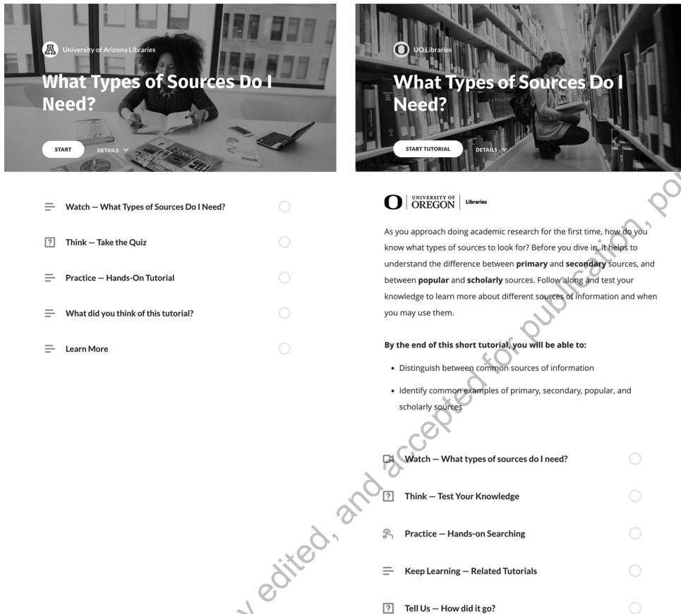
Figure 2. A side-by-side comparison of the original University of Arizona video tutorial, left , and the adapted tutorial developed by the University of Oregon, right . Each uses institution-specific branding and imagery. Oregon also added a short overview, transparent learning objectives, and consistent iconography to guide learners to different learning activities.

and representative of many parts of the library system, leveraged their existing skill sets and seized the opportunity to learn the new techniques needed to make tutorials. With the guidance and help of colleagues who understood the technical challenges, the team completed the work with impressive success.